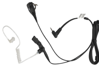
3.5mm TWO-WIRE EARPIECE WITH TRANSLUCENT TUBE