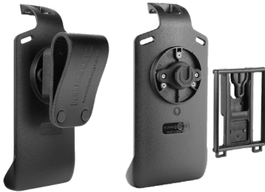
LEX L11 HOLSTER WITH AUDIO ROUTING TECHNOLOGY