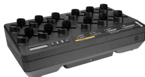
MULTI UNIT CHARGER

Charge the LEX L11 and it's spare battery at once