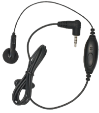
3.5mm EARBUD WITH INLINE MICROPHONE AND PUSH-TO-TALK