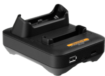
SINGLE UNIT DESKSET CRADLE

NEVER SLOW DOWN JUST SWAP OUT THE DEPLETED BATTERY FOR A NEW ONE