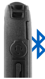
SUPPORTS OTHER 3 rd PARTY 3.5mm AND BLUETOOTH ACCESSORIES